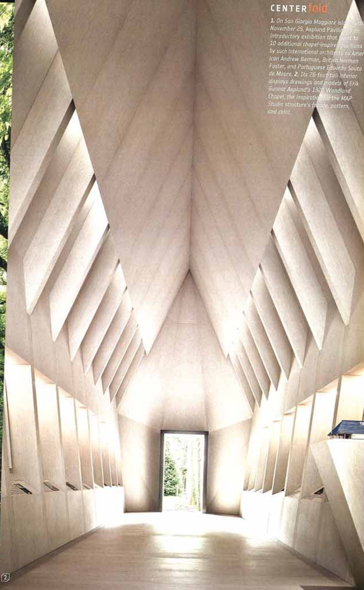
CENTER fold 1. On San Giorgio Maggiore island, until November 25, Asplund Pavilion is an introductory exhibition that leads to 10 additional chapel-inspired pavilions by such international architects as American Andrew Berman, Briton Norman Foster, and Portuguese Eduardo Souto de Moura. 2. Its 26-foot-tall interior displays drawings and models of Erik Gunnar Asplund's 1920 Woodland Chapel, the inspiration for the MAP Studio structure's facade, pattern, and color.