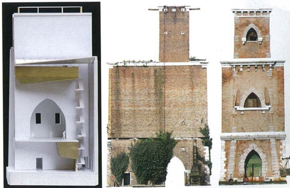
Porta Nuova Tower, winning project: T. Pelzel, F. Magnani architects; the model of the project and views of the southern and northern front of the Tower.